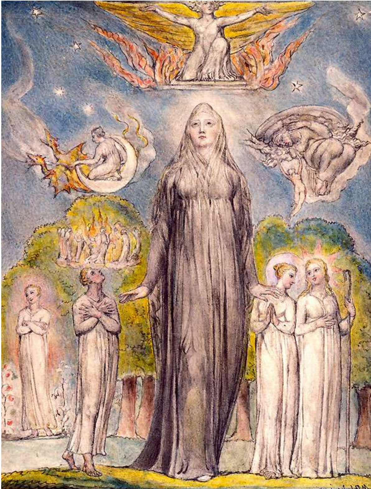
(Artist: William Blake Date: 1757-1827)