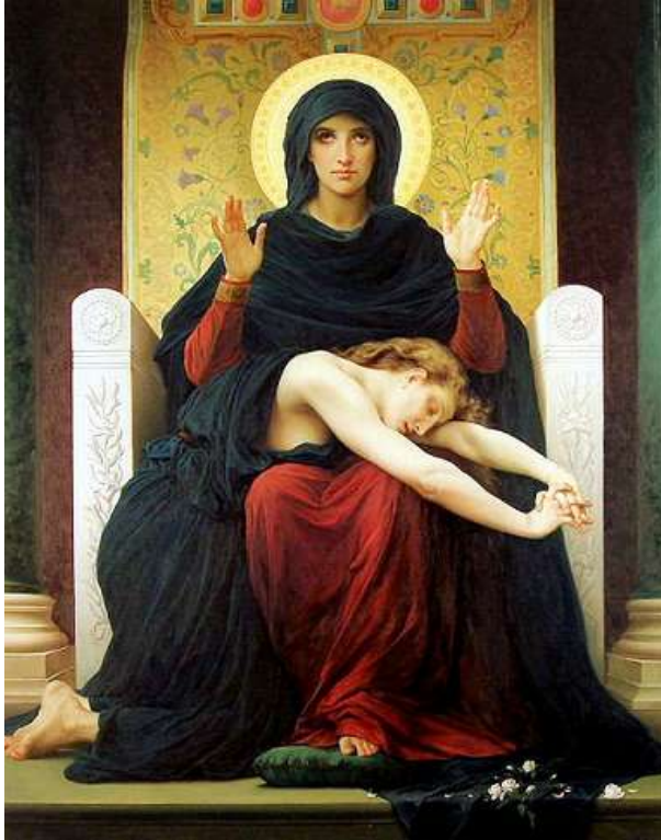
(Artist: William-Adolphe Bouguereau Date: 1825-1905)

O mother earth! I have witnessed in your kingdom the work of centuries vanishing in an hour. I have witnessed in your kingdom the drunken demon and the drunken gods. I have witnessed in your kingdom these useless revolutions. I have witnessed in your kingdom the convulsing and wounded body of mankind. I have witnessed in your kingdom the vain attempts of the mortals to paint an old face with new colours. I have witnessed in your kingdom the endless wars and carnage. I have witnessed in your kingdom the maddening ruin. O mother earth! I have witnessed in your kingdom the work of centuries vanishing in an hour.