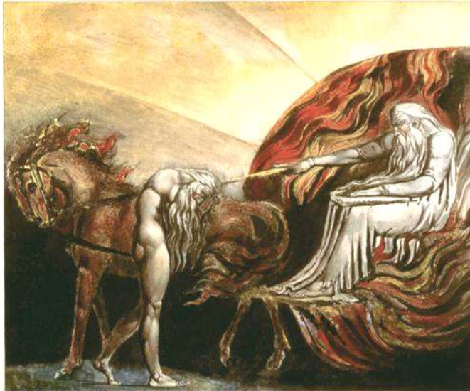
(Artist: William Blake Date: 1757-1827)

I could see the dark lord guide my fearful soul into the intense dark night.